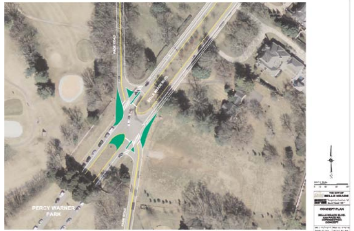
Belle Meade Blvd./Page Rd. Intersection

In addition to the installation of striping and crosswalks, the Commissioners also approved modifications to the intersec-